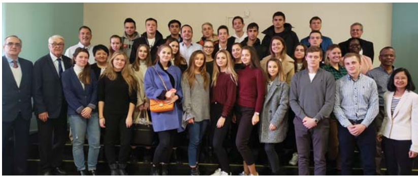
Top: Students at Russian State Agrarian University along with AGEC 710 faculty.

The faculty teaching in the AGEC 710 Comparative Food and Agriculture Systems course gathered in October to review student feedback and further develop curriculum. As part of the gathering, the Russian State Agrarian University in Moscow's Agricultural Academy, named after K.A. Timiryazev, hosted a workshop for faculty, staff, and students. The Comparative Food and Agriculture Systems faculty presented on the food, agriculture and economic situation in their respective regions. Attendees also learned about agriculture and trade in Russia from several dignitaries of the university and respected members of industry. More than 2,500 students have interacted with the AGEC 710 material since the course began in 2003 and the course is currently taught at four universities across the globe.